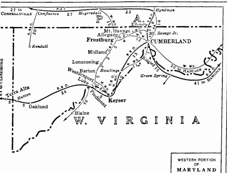
WESTERN PORTION OF MARYLAND

Copyright by Rand McNally & Company, Chicago. Made in U.S.A.