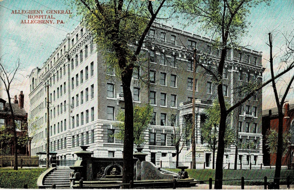
ALLEGHENY GENERAL HOSPITAL, ALLEGHENY, PA.